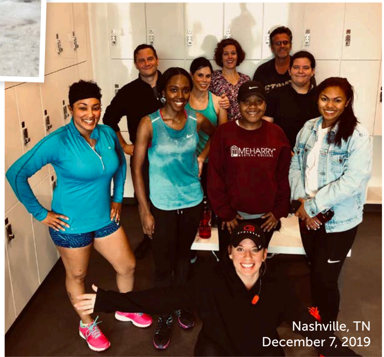
Nashville, TN December 7, 2019

OCRA's series of indoor cycling events are the perfect way to work out, have fun and raise money for ovarian cancer research! Rides were held across the country, from San Mateo to Detroit, LA to Tampa, and everywhere in between.