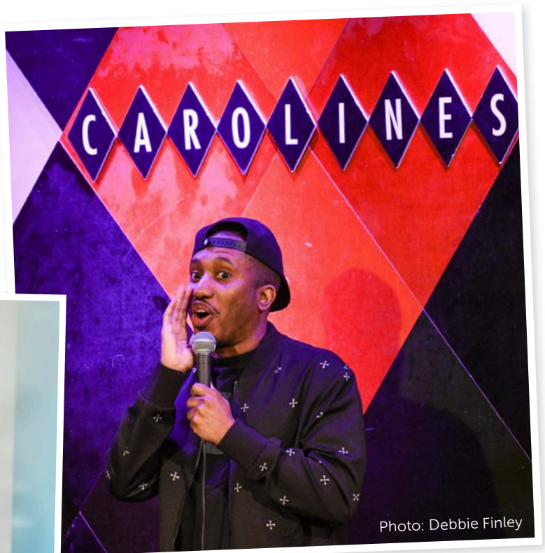
▲ Comedian Chris Redd

A hilarious evening for a serious cause, celebrating the life of legendary funny lady, Madeline Kahn with New York City's top comedians at Carolines on Broadway.